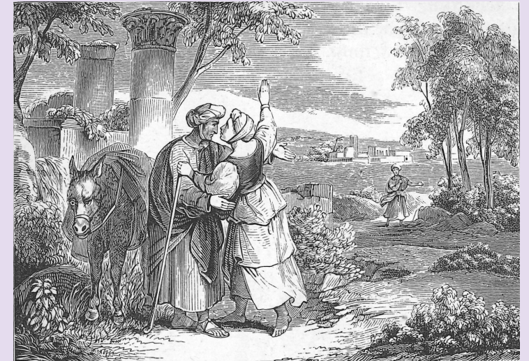
Ruth and Naomi by John Gadsby Chapman, published in the Illustrated Bible, 1846

Together, pressing in toward Christ; reaching out to the world.