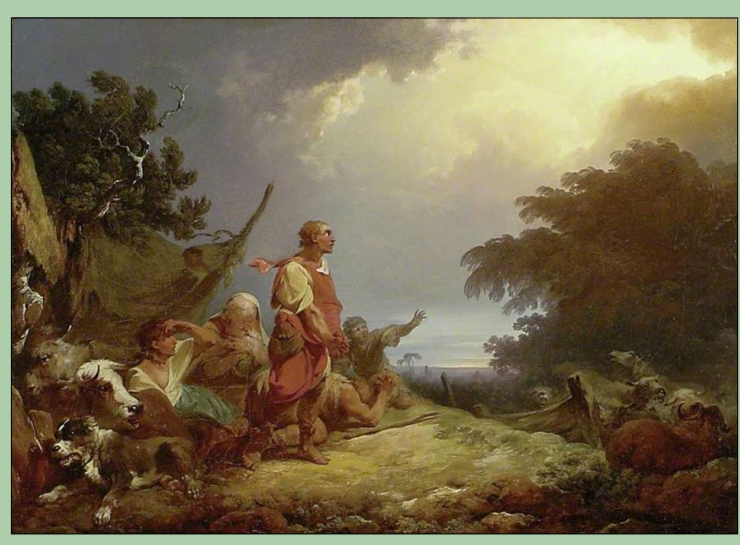
The Angel appearing to the Shepherds By Philip James de Loutherbourg (circa 1760)