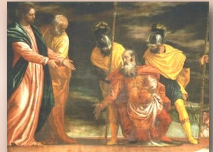
Jesus Healing the Servant of a Centurion , by Paolo Veronese, 16th century

Together, pressing in toward Christ; reaching out to the world.