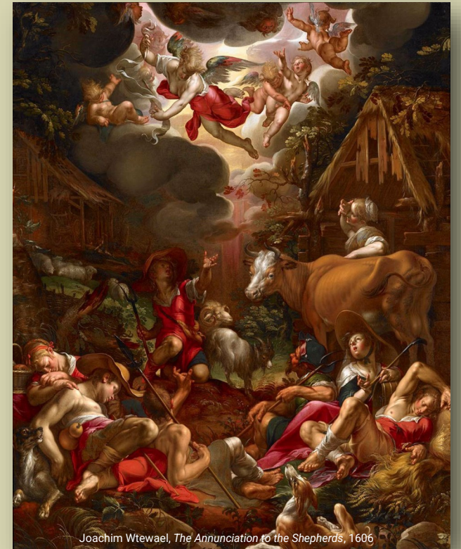
Joachim Wtewael, The Annunciation to the Shepherds , 1606

Together, pressing in toward Christ; reaching out to the world.